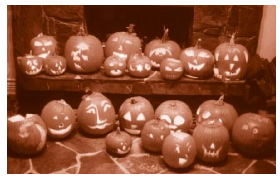
The congregation of Beacon Unitarian gets together to carve pumpkins at Halloween.

And, finally, it's only fair to say that we've also committed to "accept graciously if you decline an opportunity or decide to leave a volunteer position before the term is complete."