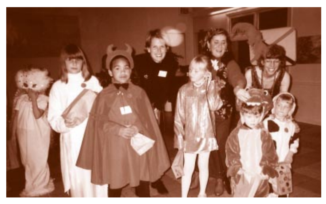
After an hour of games, these kids from the Unitarian Congregation of South Peel will gather in a solemn circle to mark the passing of the year – much like the Celts did on their Feast of the Lord of the Dead (Samhain).